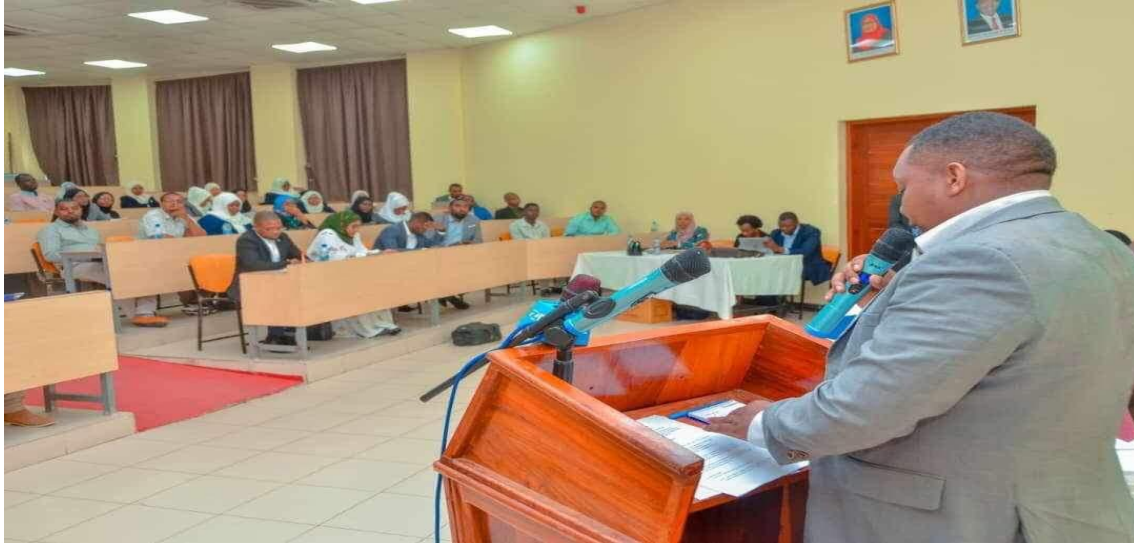
ZLRC organized two-day training on proper investigation and prosecution techniques for Economic Crime and Drug-related Offenses for prosecutors and investigators from ZAECA and ZDCEA