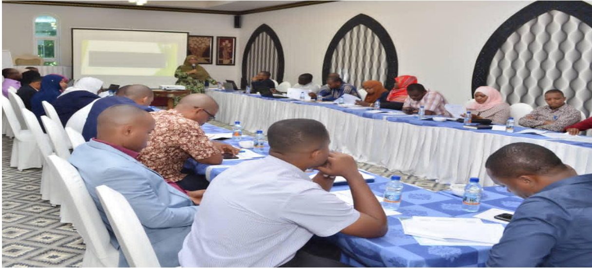
Training for Prosecutors on Issues of Sexual Abuse at the Madinatul-Bahar Hotel Hall. 29/3/2022