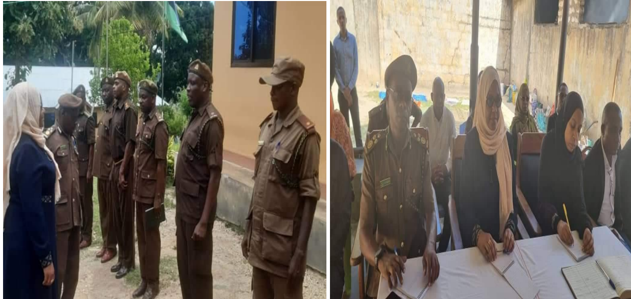
DPP Management visited the Tungamaa and Kangagani Offender's Education Centre in Pemba, 03, April 2022

arise during the incarceration period. The partnership between the DPP and the prison system involves collaboration to ensure that legal sentences are enforced, cases are managed effectively, and rehabilitation efforts are supported.