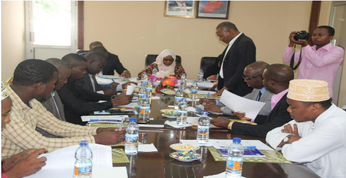
Meeting between DPP Management and Criminal Justice Stakeholders at Pemba Island.

feedback to the police on the quality of investigations and evidence submitted. This feedback helps the police improve their practices and ensures that future cases are handled more effectively.