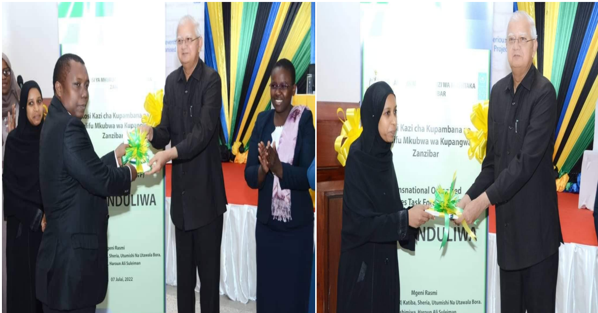
The Minister (PO) Constitution, Law, Public Service, and Good Governance, Hon. Mwalim Haroun Ali Suleiman, handing over operational documents of the Transnational Organized Crime Task Force on 07/07/2022."

These initiatives are designed to strengthen the capacity of Zanzibar’s law enforcement to combat transnational organized crime effectively.