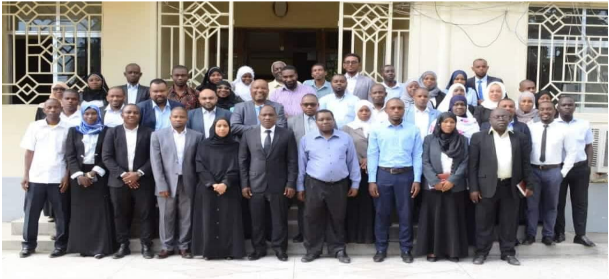
The Director of Public Prosecutions, with the Heads of Departments, Regions, Units, Divisions and other staffs, on September 29, 2022, at the DPP Office, Miembeni, after being appointed.

Each department is further divided into divisions to facilitate exercise of departmental functions. Apart from departments and divisions, there are regional prosecution offices that are dealing with prosecution works at regional and district levels. Until the end of the year 2022, the new organization structure of the Office is in the process of decision making at governmental level.